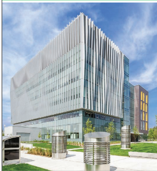
University of Toronto Scarborough | Environmental Science and Chemistry Building | LEED® Gold | Scarborough, ON