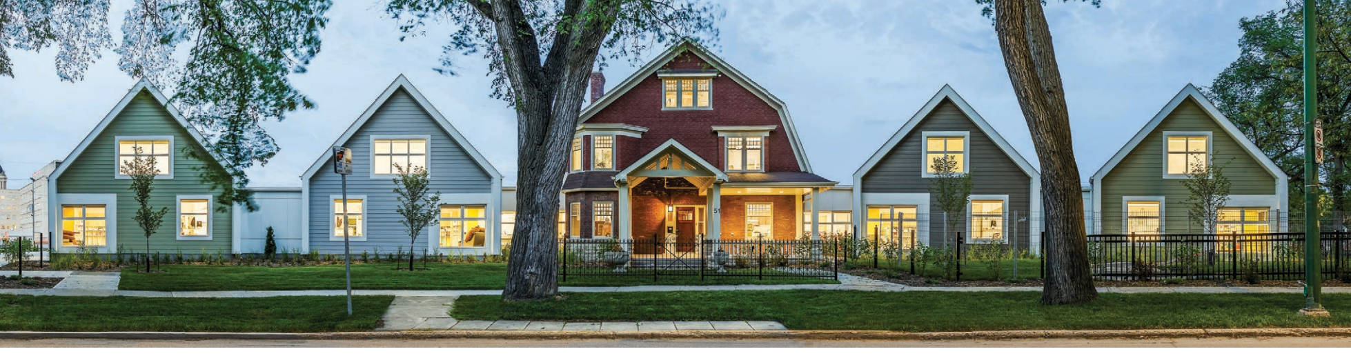
Building Blocks on Balmoral, Winnipeg, MB.

"We have had the great fortune of working with many champions over the past year with projects that have pushed the boundaries of their typological norms," explains Oster. "The Building Blocks on Balmoral childcare facility for Great-West